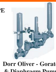
Dorr Oliver - Gorator & Diaphragm Pumps