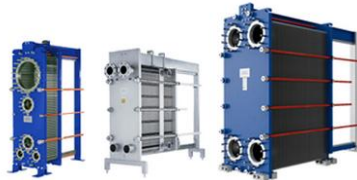
Specialized Plate & Frame Heat Exchangers