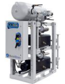
Package Lab Vacuum System

Alfa Laval is the world leader in plate & frame and spiral heat exchangers.