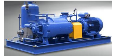
Liquid Ring & Dry Screw Skids

Gardner Denver Rietschle offers industrial vacuum pumps & blowers including: side channel, dry & oil lubricated sliding vane, and dry claw.