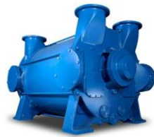
Liquid Ring Pumps