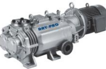
Dry Screw Pumps