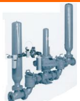
Dorr Oliver - Gorator & Diaphragm Pumps